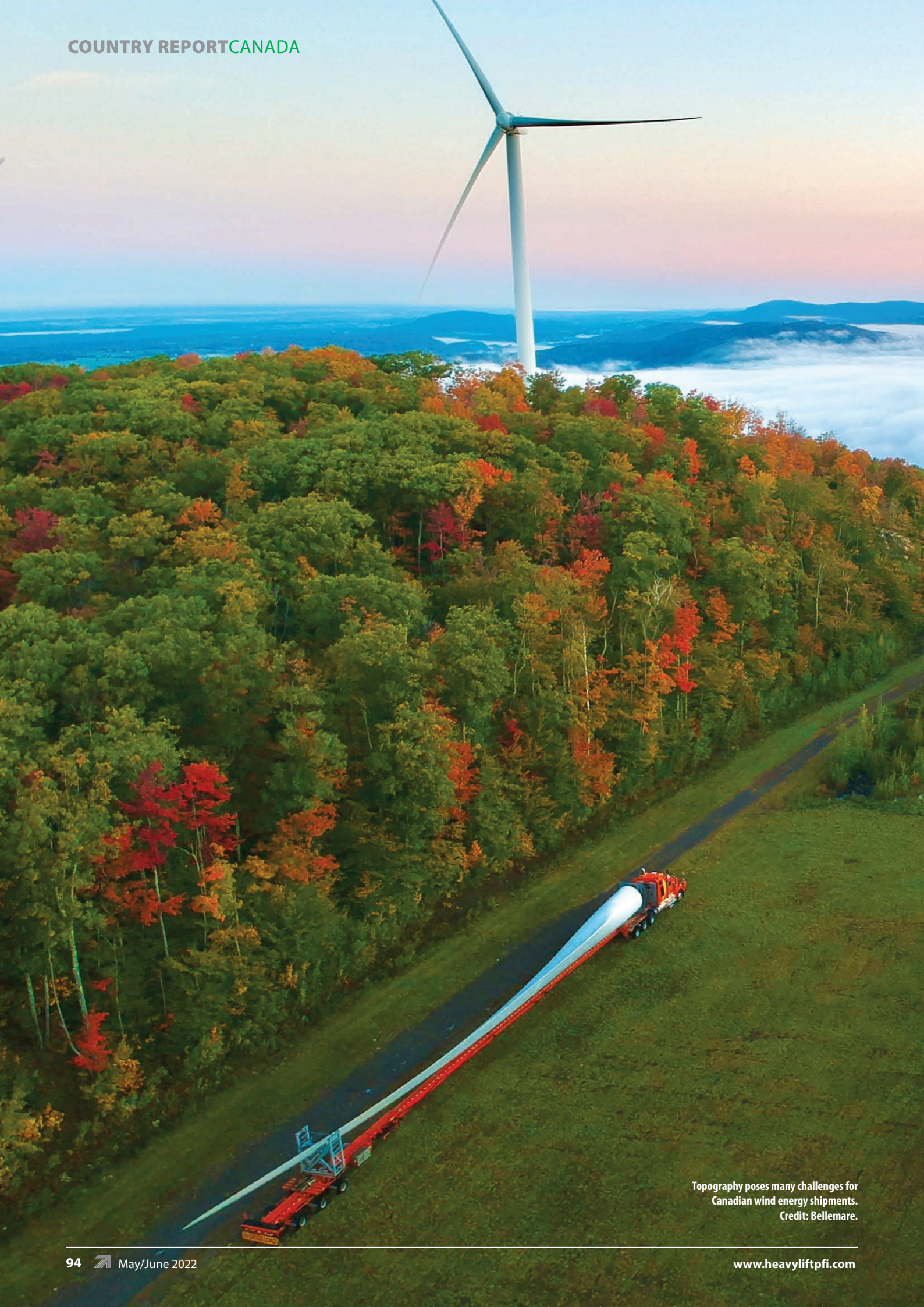
Topography poses many challenges for Canadian wind energy shipments.